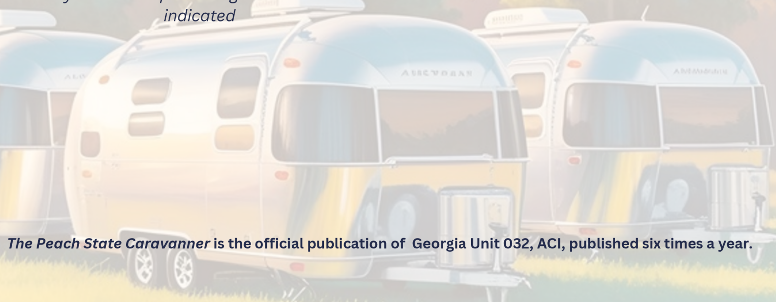
The Peach State Caravanner is the official publication of Georgia Unit 032, ACI, published six times a year.