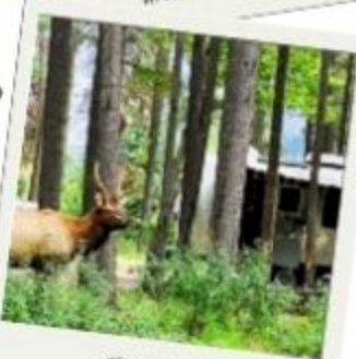
Elk in Banff! Lori Grassl BRN716