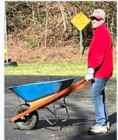
Work smarter not harder