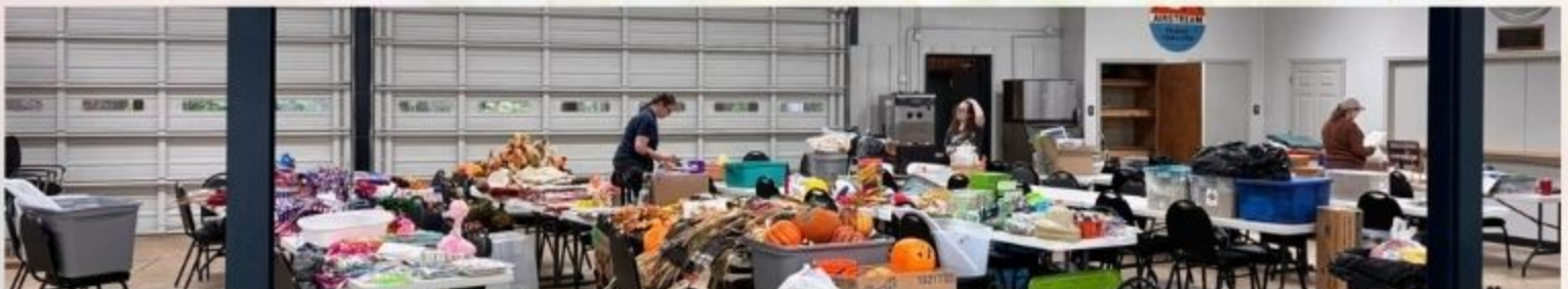
Storage Room/Decoration organization. We now have an itemized list with photos!