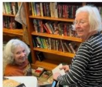
Get those books in shape ladies