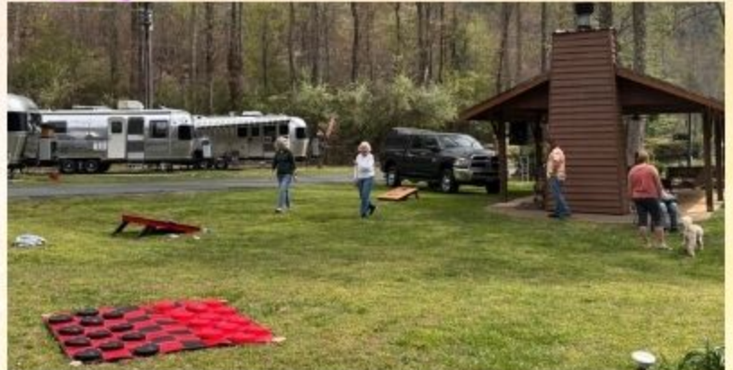
Games on the lawn