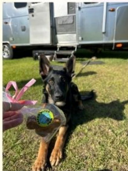
Zoey Cardoza growing fast & getting flamingo'ed at the Region 3 Rally