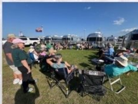
TOG happy Hour