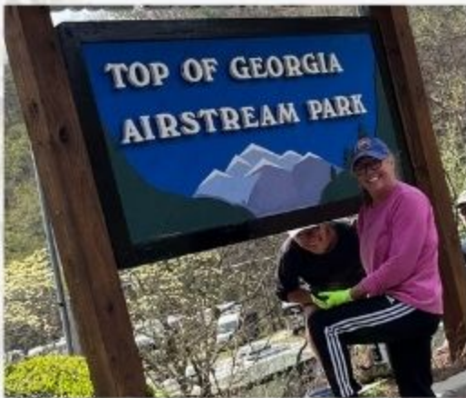
Newly painted TOG sign